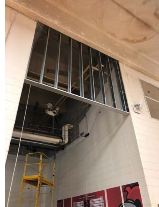
Bulkhead Framing for Performance Gym