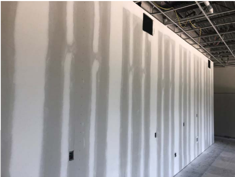
Family Living Center Drywall