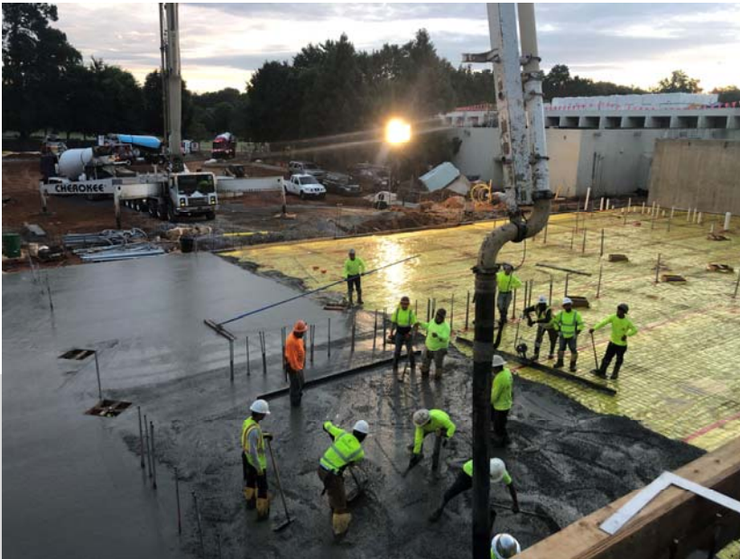
New Addition Slab Pour