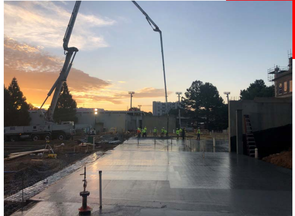
New Addition Slab Pour