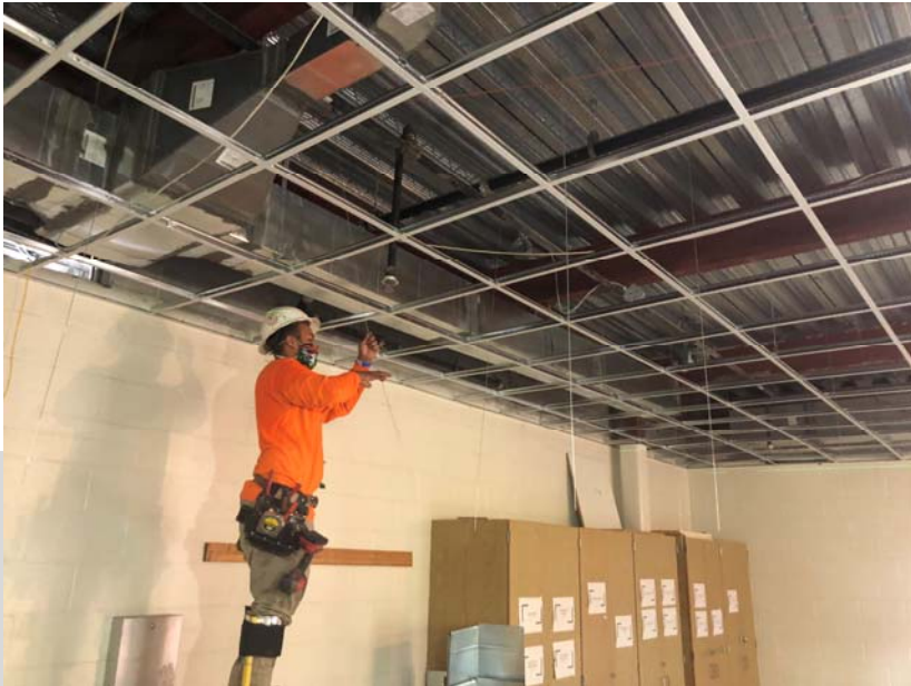
Installing Ceiling Grid in 8 th St. Building