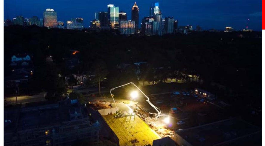
New Addition Slab Pour