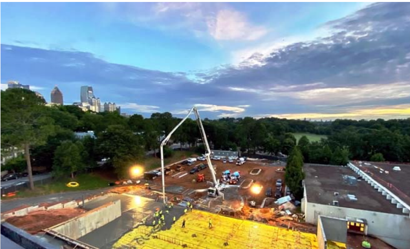
New Addition Slab Pour