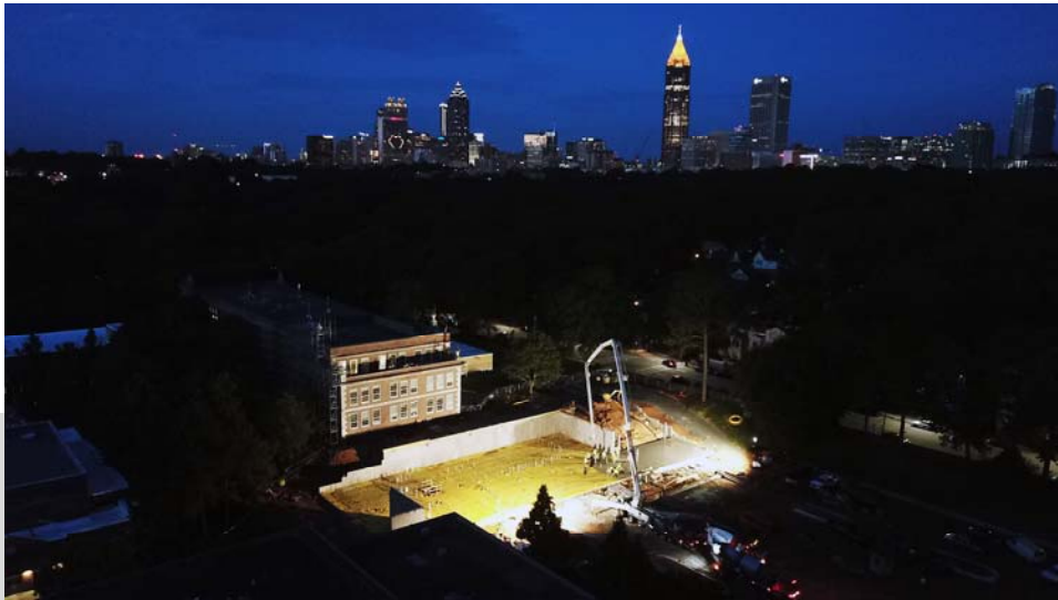
New Addition Slab Pour