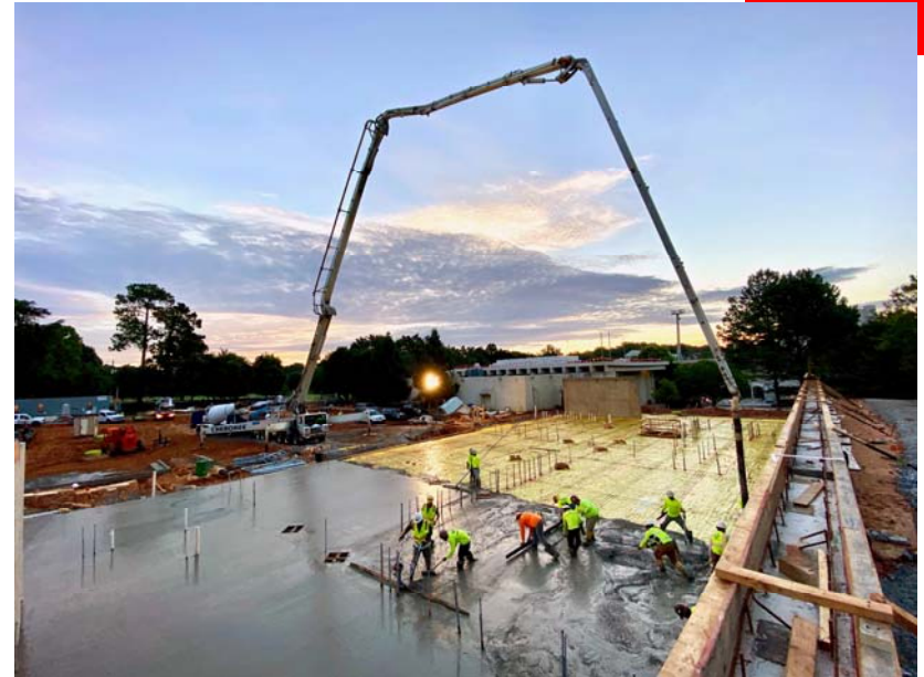
New Addition Slab Pour